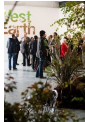
Guests at East-West, Spirit, Earth exhibition